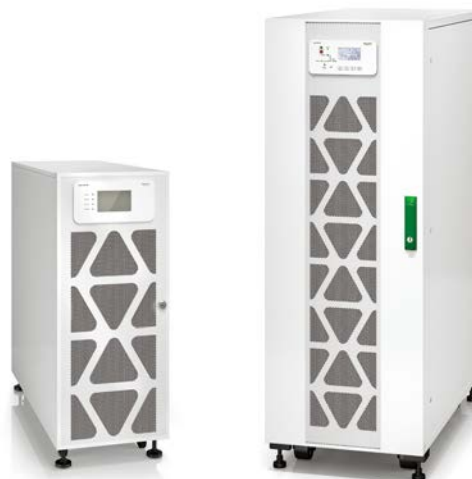
100 kVA Easy UPS 3M for external batteries

*Included with Easy UPS 3M; recommended service option for Easy UPS 3S