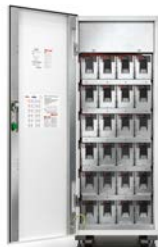
Modular battery cabinet for extended runtime requirements (compatible with Easy UPS 3S and Easy UPS 3M 60-80 kVA with internal batteries)